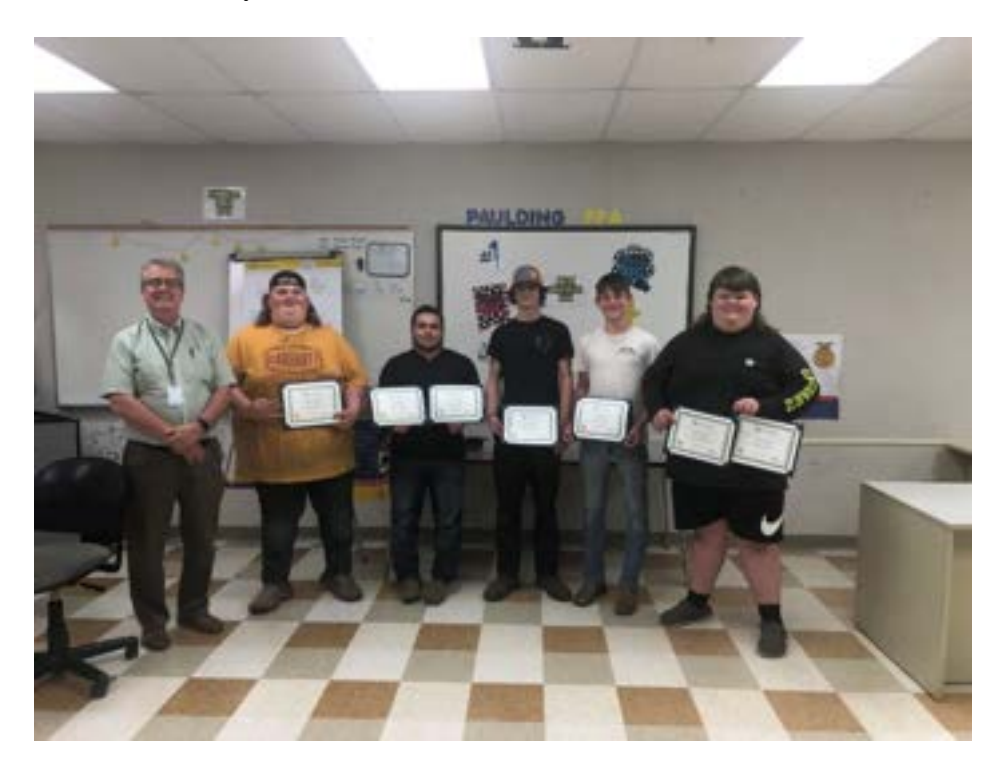
Rockwell Automation – NSCC trained Rockwell automation employees on programmable logic controller (PLC) hardware.

Paulding High School – In the Spring of 2023, 5 students completed the welding and blue print basic class with yellow belt certification.