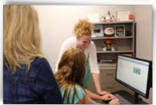
Contact your academic advisor today!

Office location: C140 Phone: 419.267.1390 Email: advising@northweststate.edu